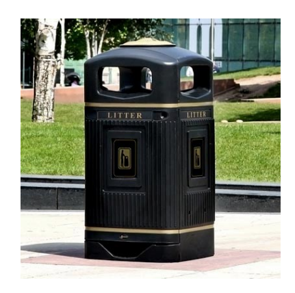
Glasdon Jubilee approximate cost £440