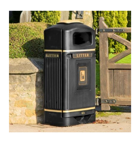
Glasdon Jubilee Streamline approximate cost £390