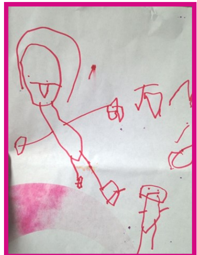
"Daddy is angry."

→ Bromley Children Project 3rd Floor Central Library Bromley BR1 1EX